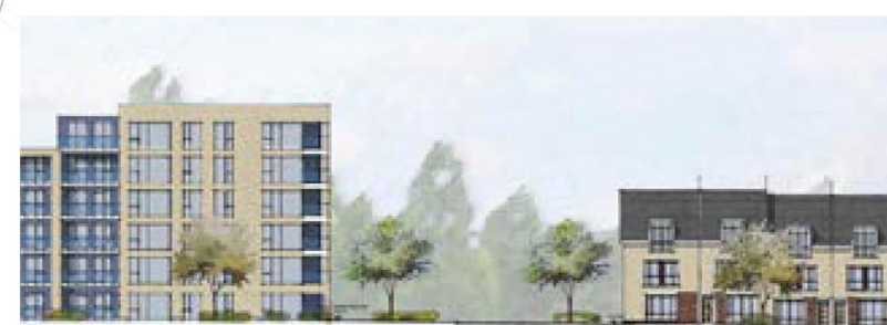
Future planning application character area 6