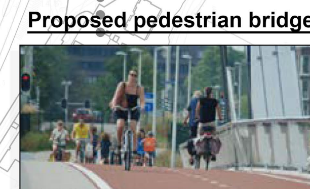
Proposed pedestrian bridge