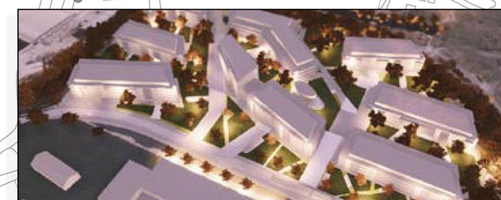
Envisaged character area 1 fully realized partially part of future planning application