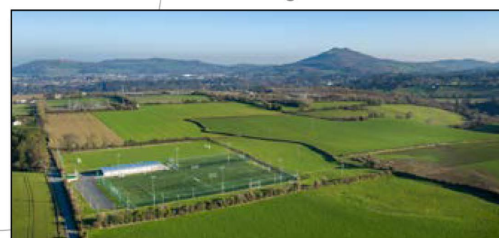
3.1 Hectares active open space Already provided by Cosgrave.