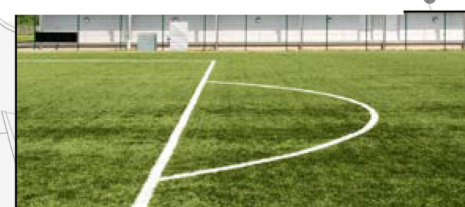
3 Hectares active open space