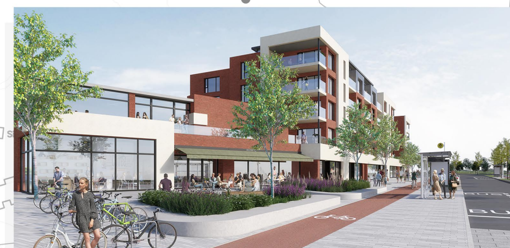
CGI character area 1 Neighbourhood Centre