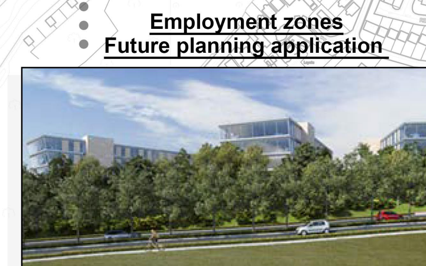
Employment zones Future planning application

Approx.Total Schedule of Areas: Residential development lands: 38.75 hectares 2,297 Units 59.28 res. units per hectare